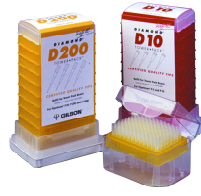
Gilson Tower Pack Refill Trays