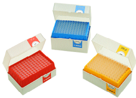
Gilson Standard Racks