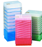
Rainin SpaceSaver Insert Trays